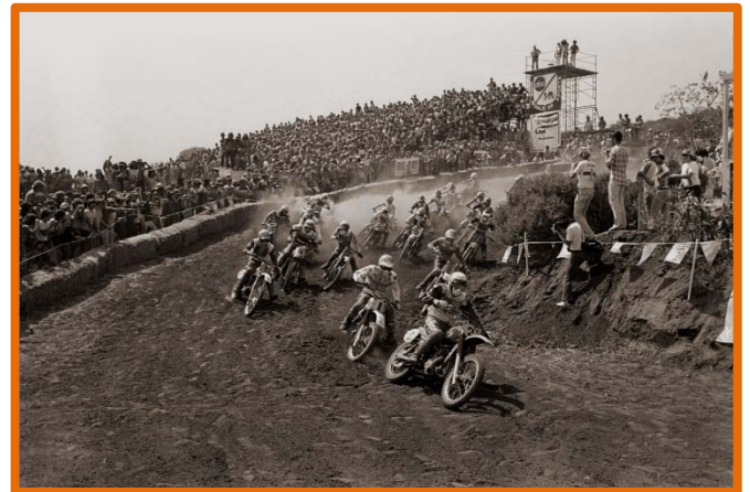
Carlsbad USGP 1978 ~ Honda mounted Brad Lackey #2 leads the pack.

This venue is also the 3 rd & 4 th stops of the AHRMA (American Historic Racing Motorcycle Association) National Vintage Motocross Series. AHRMA was responsible for the rebirth of classic vintage motorcycle racing in America. Additionally, the AHRMA Legends Group will be honoring Carlsbad Raceway as the most famous race track in the USA, according to Brad Lackey, who raced and won there from 1969 thru 1983. Carlsbad Raceway was home of the 500cc World Championship in the USA for many years.